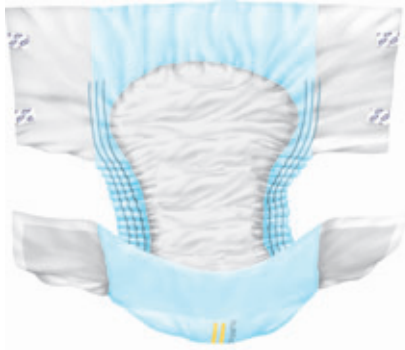
TENA ULTRA BRIEF