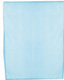
DISPOSABLE UNDERPAD 353

†See Clinical Equipment, pages 201-205, to see SOURCE's offering of therapeutic mattresses, including low air loss systems.