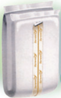
LIGHT INSERT 342