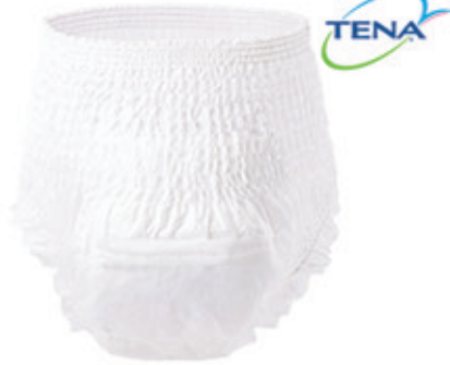
TENA PLUS UNDERGARMENT