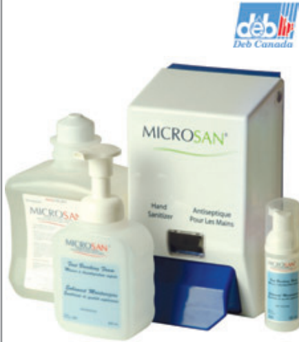
MICROSAN ANTISEPTIC PRODUCT OFFERING