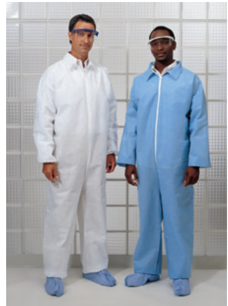
CARDINAL PROTECTIVE COVERALLS