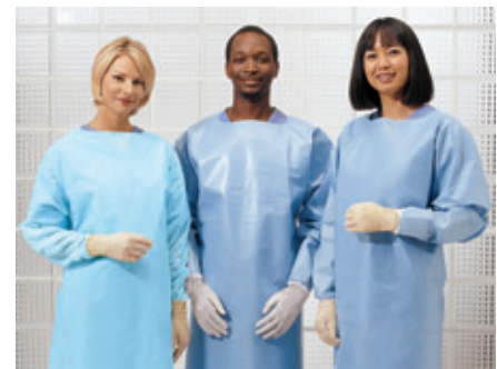
CARDINAL IMPERVIOUS GOWNS