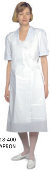
018-400 PLASTIC APRON