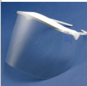
HSHEILD50 HALF-FACE SHEILD