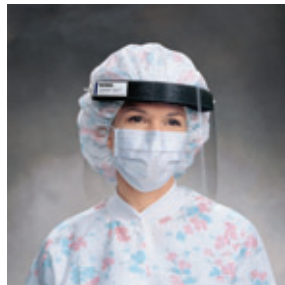
KC41204 FULL LENGTH VISOR (MASK NOT INCLUDED)