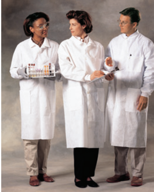
KIMBERLY CLARK LAB COATS