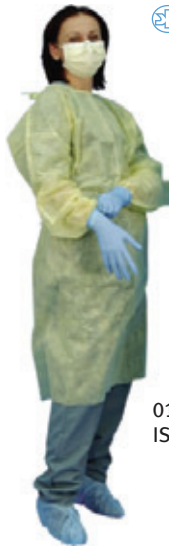
KC STAFF APPAREL