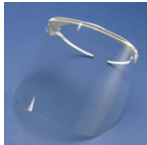
FSHEILD50 FULL-FACE SHEILD