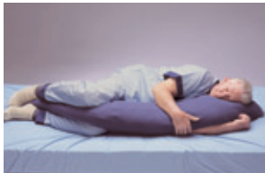
5163-6306 POSEY® BEDFELLOW POSITIONING ROLL