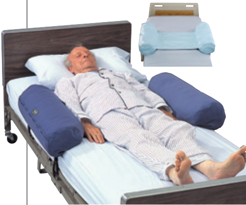
5163-5700 POSEY® ROLL GUARD