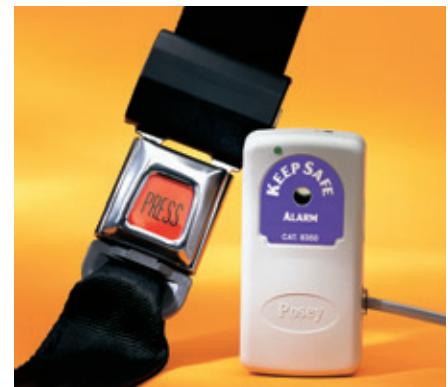
POSEY® KEEPSAFE® CHAIR BELT SYSTEM