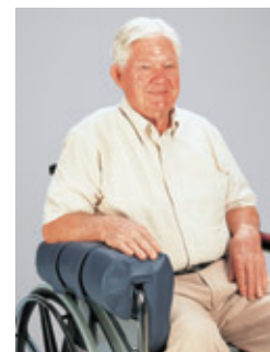
POSEY® DELUXE LATERAL ARM SUPPORT