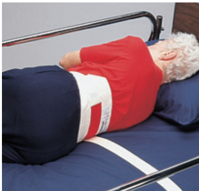
5163-1231 COTTON ROLL BELT