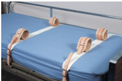
5163-2206 & 5163-2207 – CONNECTED LEATHER WRIST & ANKLE CUFFS