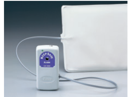
POSEY® KEEPSAFE® CHAIR PAD SYSTEM