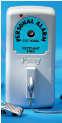
POSEY® PERSONAL ALARM