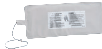
POSEY® ALARM CHAIR PAD SENSOR