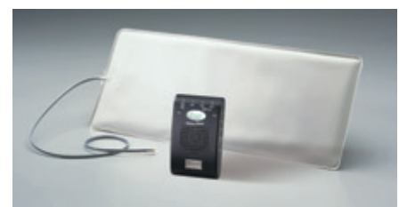
POSEY® SITTER SELECT ALARM UNIT