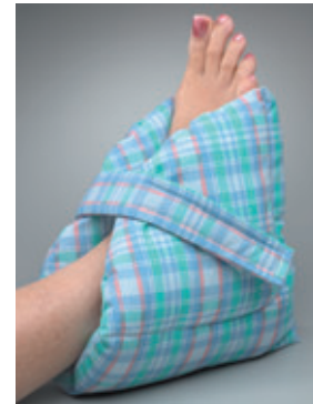
5163-6115 QUILTED HEEL PILLOW