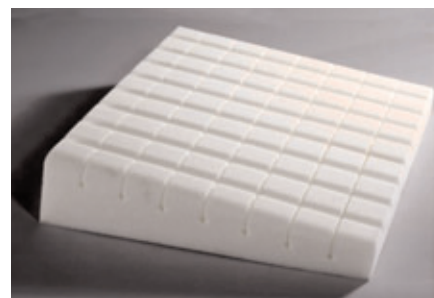
GEO-MATT® WEDGE CUSHION