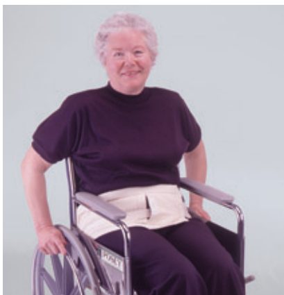
5163-1731 BODY HOLDER