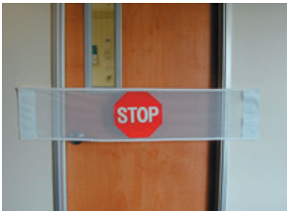
POSEY® DOOR GUARD