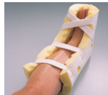
5163-6145 - HEEL GUARD