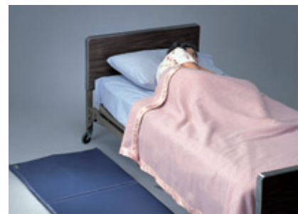
POSEY® FLOOR CUSHION

SOURCE MEDICAL is proud to state that every product available for sale is compliant with all Health Canada regulations. Our in-house RAQA team ensures it. Whether it's a medical device license, DIN registration, or ISO13485, if a product requires it, SOURCE makes sure it complies... or SOURCE won't sell it!