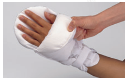
5163-2811 – POSEY® PEEK-A-BOO MITTS