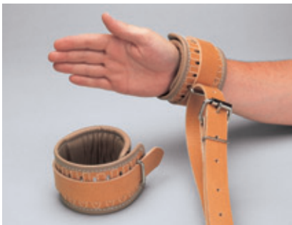
5163-2203 – UNCONNECTED SYNTHETIC LEATHER CUFFS