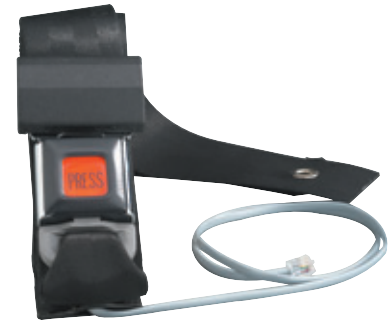
POSEY® ALARM CHAIR BELT SENSOR