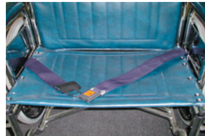
POSEY® ALARM MOBILE CHAIR BELT SENSOR