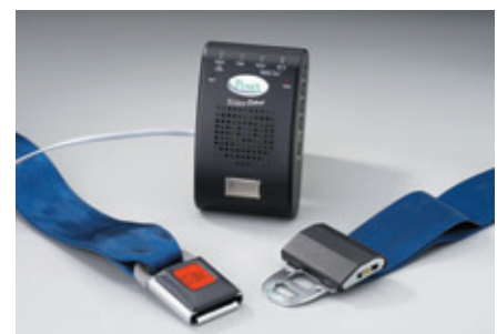
POSEY® SITTER SELECT WHEELCHAIR BELT SYSTEM