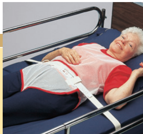
5163-3420LGE – HOUDINI SECURITY SUIT