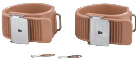
5163-2835 – E.D. SECURITY CUFF WITH KEY LOCK