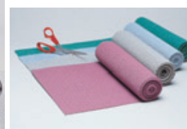
POSEY® GRIP™ NON-SLIP MATTING