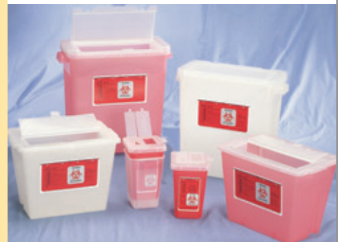
BEMIS SHARPS CONTAINERS