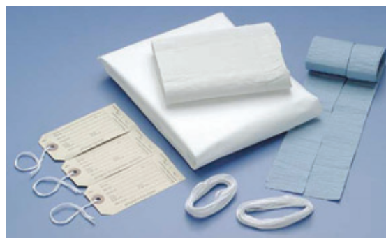
BUSSE SHROUD PAK