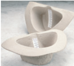
BIODEGRADABLE URINE SPECIMEN COLLECTOR