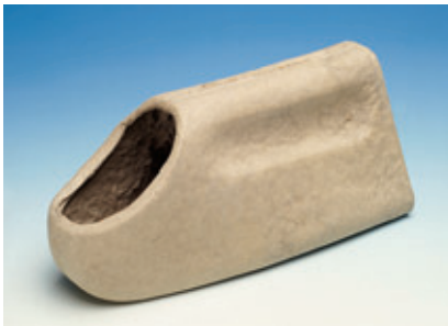
V20-020 BIODEGRADABLE FEMALE URINAL